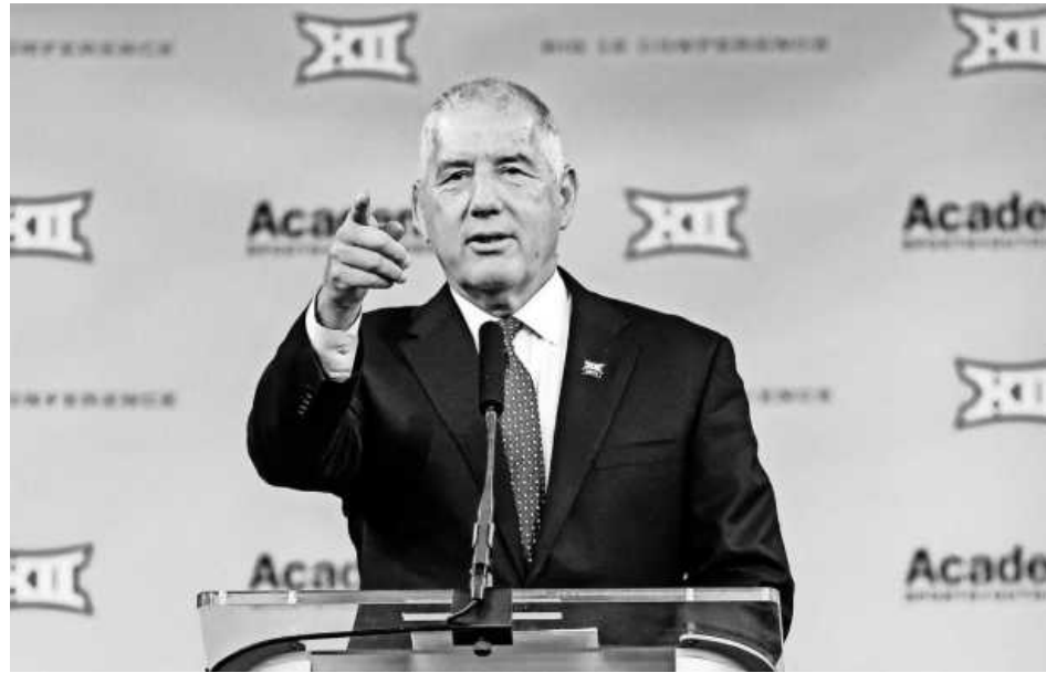
Big 12 Commissioner Bob Bowlsby is optimistic about the conference's future.

For all those words, there aren't many specifics. I assume that's partially because the Big 12 doesn't have a lot of answers right now — the notion of the con-